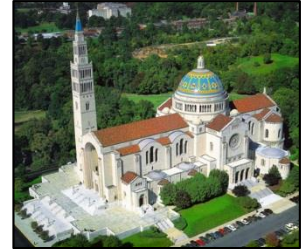
Basilica of the National Shrine of the Immaculate Conception

Members of the Komitas Choir are invited to participate in the May 9 Badarak. Rehearsals are mandatory: