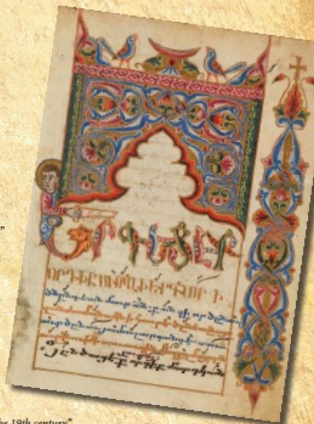
Fol. 416 ff. - 13.1 x 10 cm - Arminiensis, Khizan as the Province Van - 1642. Ordn: Ulepis, armarhus cadum (schaphulorum, Cad. 4; Armenian Hymnarius (Sharaknisi)) ( http://www.e-codices.unifr.ch/en/lat/ao/0004 )