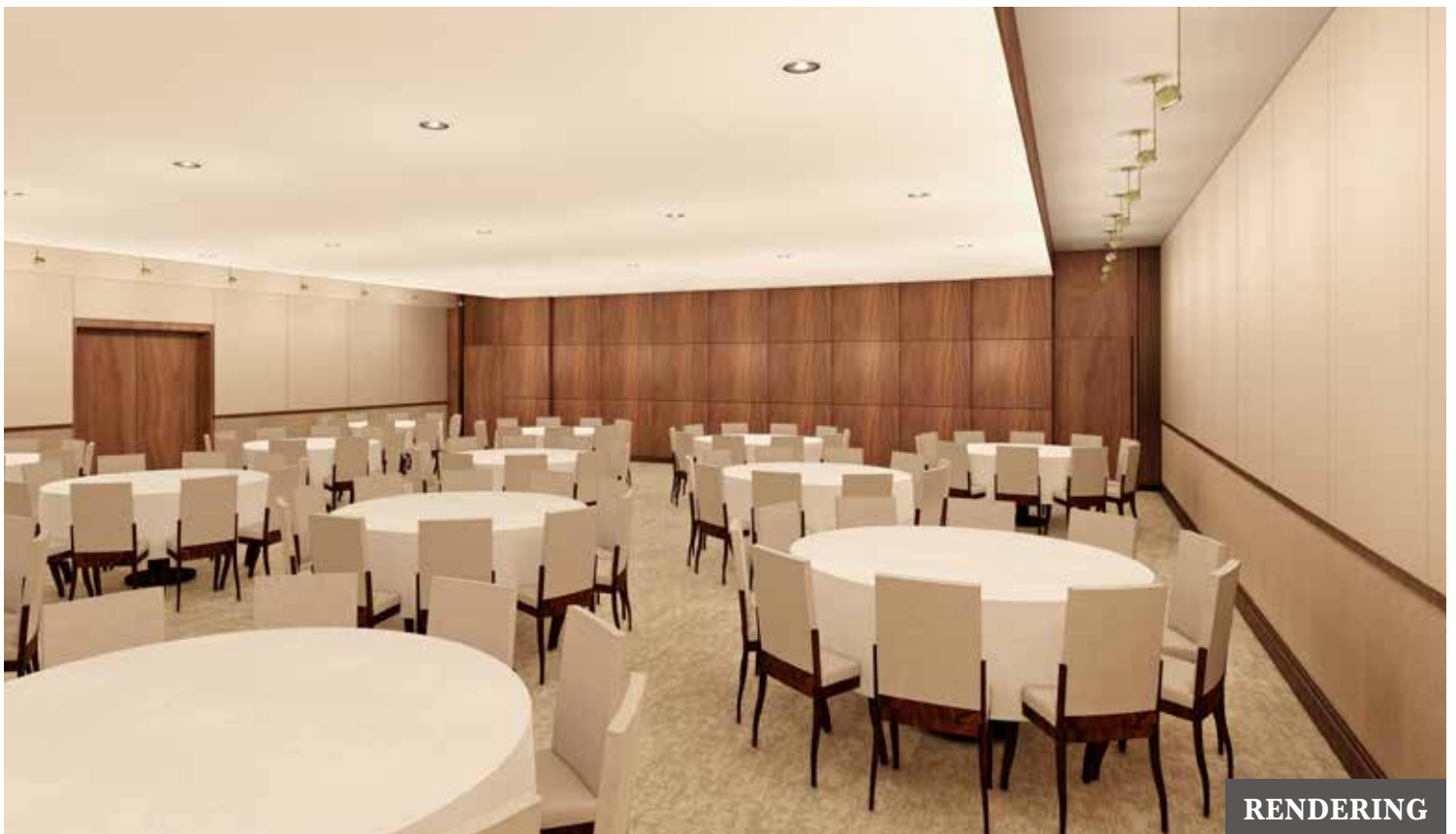
St. Vartan Room