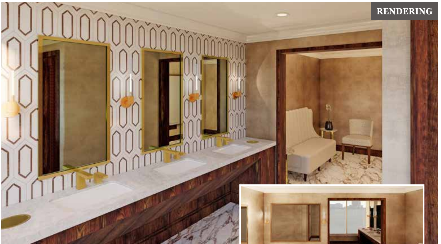
Women's Restroom and Lounge