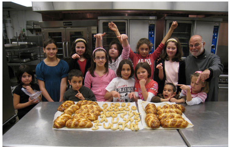
The final product of the cooking class