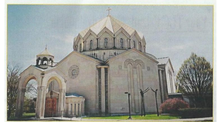
St. John Armenian Church

There is the story of a pastor who got up one Sunday and announced to his congregation: "I have good news and bad news. The good news is, we have enough money to pay for our new gym-fellowship hall building program. The bad news is, it's still out there in your pockets."