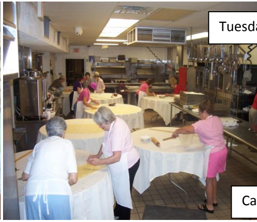
Tuesday Baking – KATAH