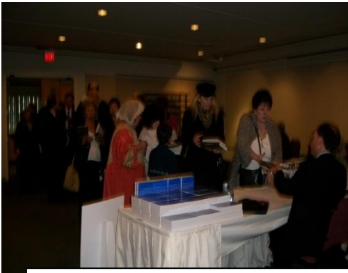
Above left: Chris Bohjalian signs copies of The Sandcastle Girls and Midwives April 24 th at the annual commemoration of the Armenian Genocide.