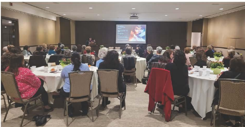
We enjoyed an afternoon of spiritual reflection and fellowship

And secular service vs. Christian service, When the world tells us that serving and loving others doesn't matter, we must remember - "Acquire the spirit of peace and a thousand souls around you will be saved." (St. Seraphim of Sarov)