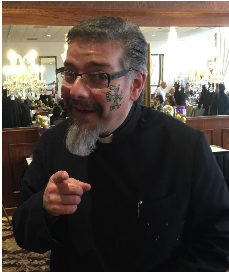
"See you in Church on Sunday!"