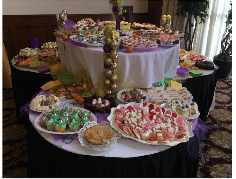
An array of beautiful desserts!