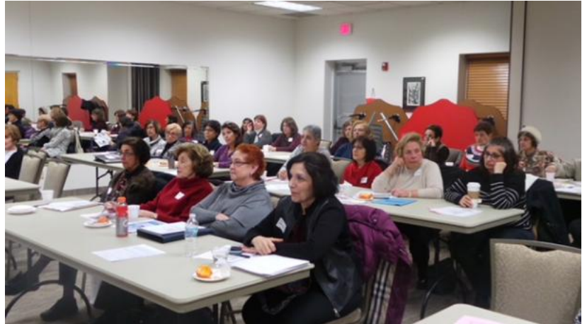
Guild members left the meeting with many helpful organizational tips.