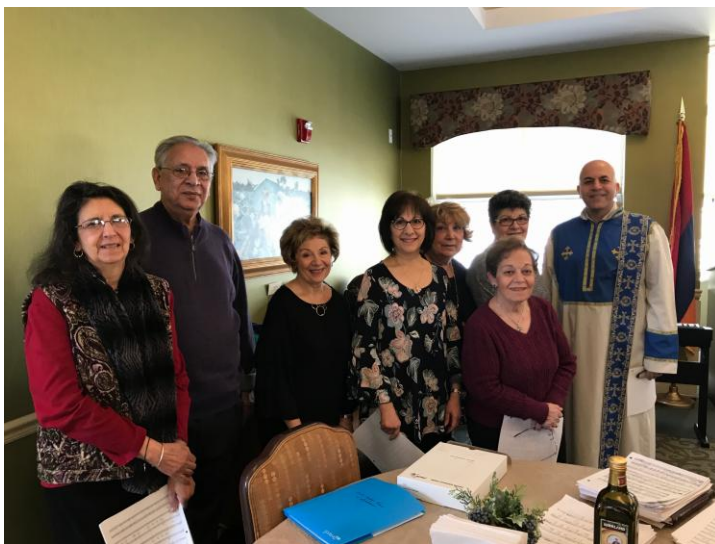
St. John Choir members