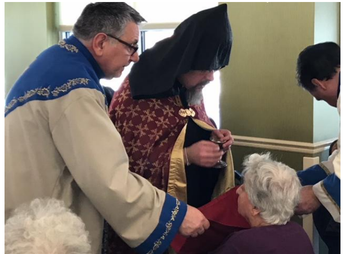
Manoogian Manor resident receiving communion and holy water