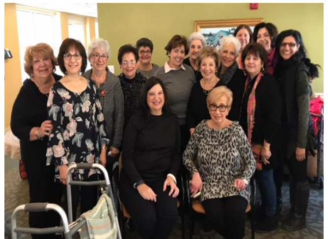
St. John Women's Guild members