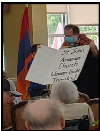
Thank you card from residents For the Women's Guild

churches and other Christian churches alternated weekly, giving all residents and opportunity for multiple services... adding he felt blessed to be a priest and pray with neighbors. Every time I enter Manoogian Manor I only smile: the beautiful grounds, the wonderful staff, and dad's amazing memory fill the special place. To quote dad, 'God bless those advanced in age, such a true gift'".