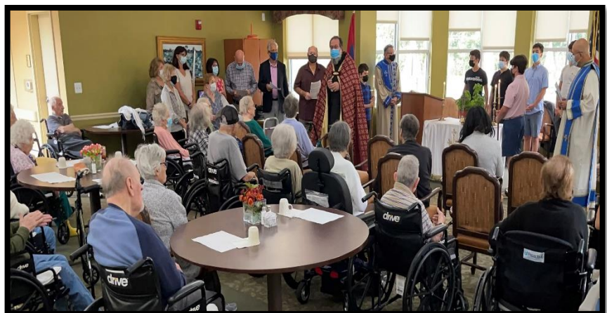
Blessings at the Manor